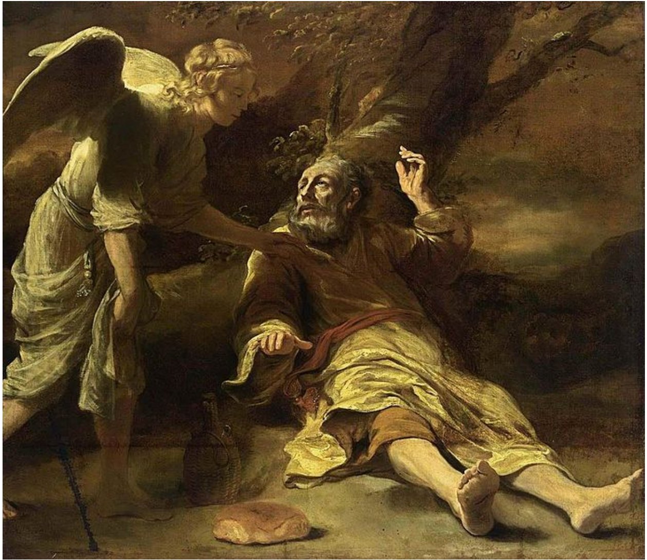
Ferdinand Bol (1616–1680), Elijah fed by an Angel