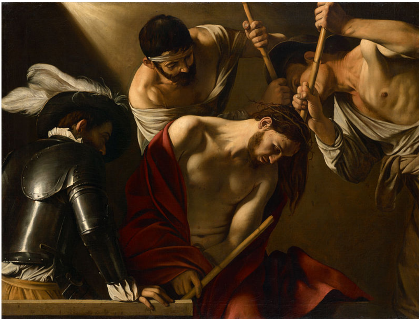
Caravaggio - The Crowning with Thorns , 1603