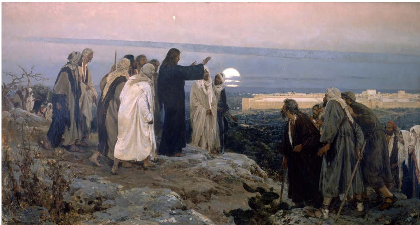
Public Domain: "He Wept Over It" by Enrique Simonet, 1892