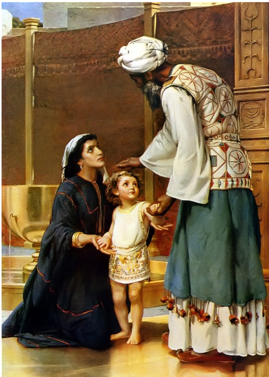
Public Domain: Samuel Dedicated by Hannah at the Temple by Frank W.W. Topham

♿ ♪ Hymn No: 433 All people that on earth do dwell