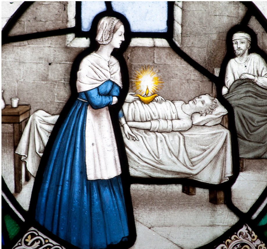
Stained glass detail from St Aidan's church, Bamburgh.