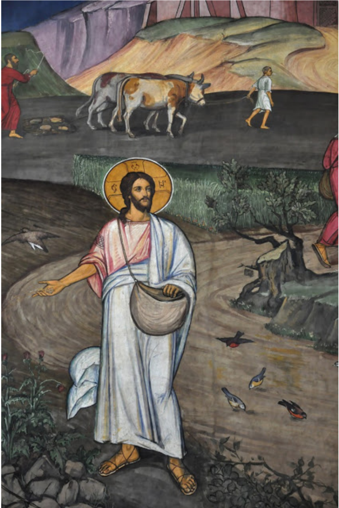
From a mural in Brasov, Romania - original artist unknown.