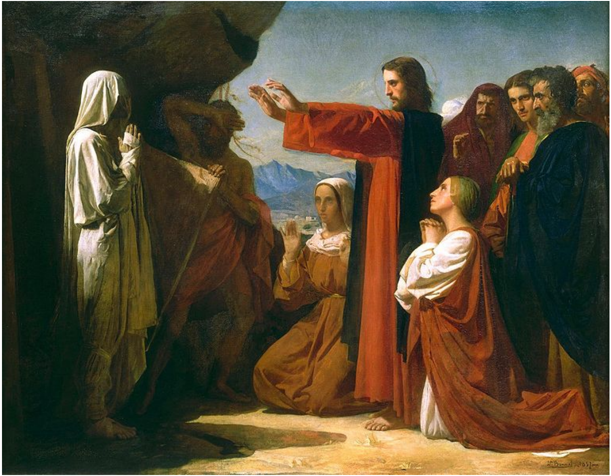
Léon Bonnat (1833–1922). The Resurrection of Lazarus or The Raising of Lazarus , 1857.