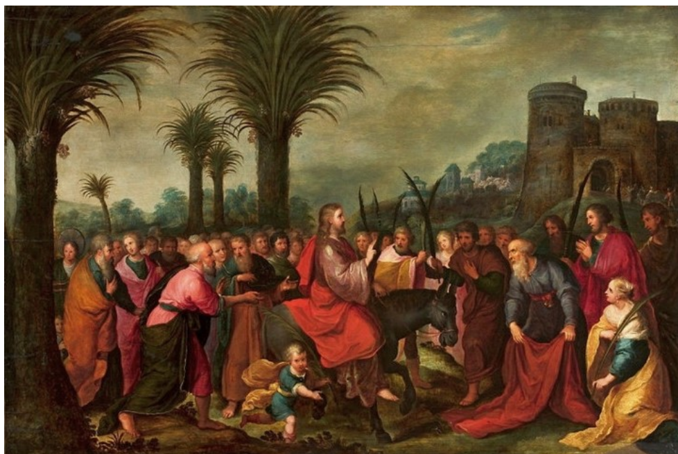
Frans Francken the Younger: Entry into Jerusalem second quarter of 17 th century

♣ ♪Hymn No: 239 Son of God, eternal Saviour