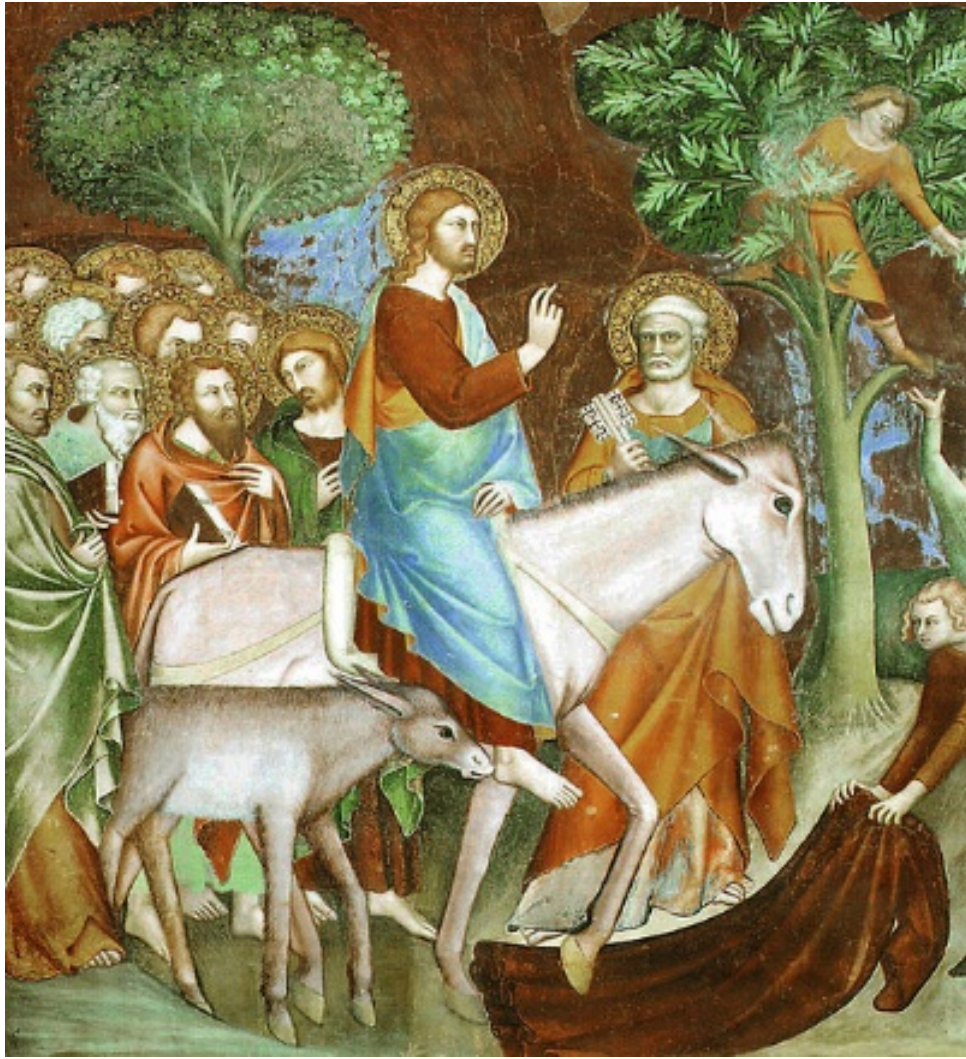
Lippo Memmi (1291–1356), Christ's entry to Jerusalem, duomo di san Gimignano